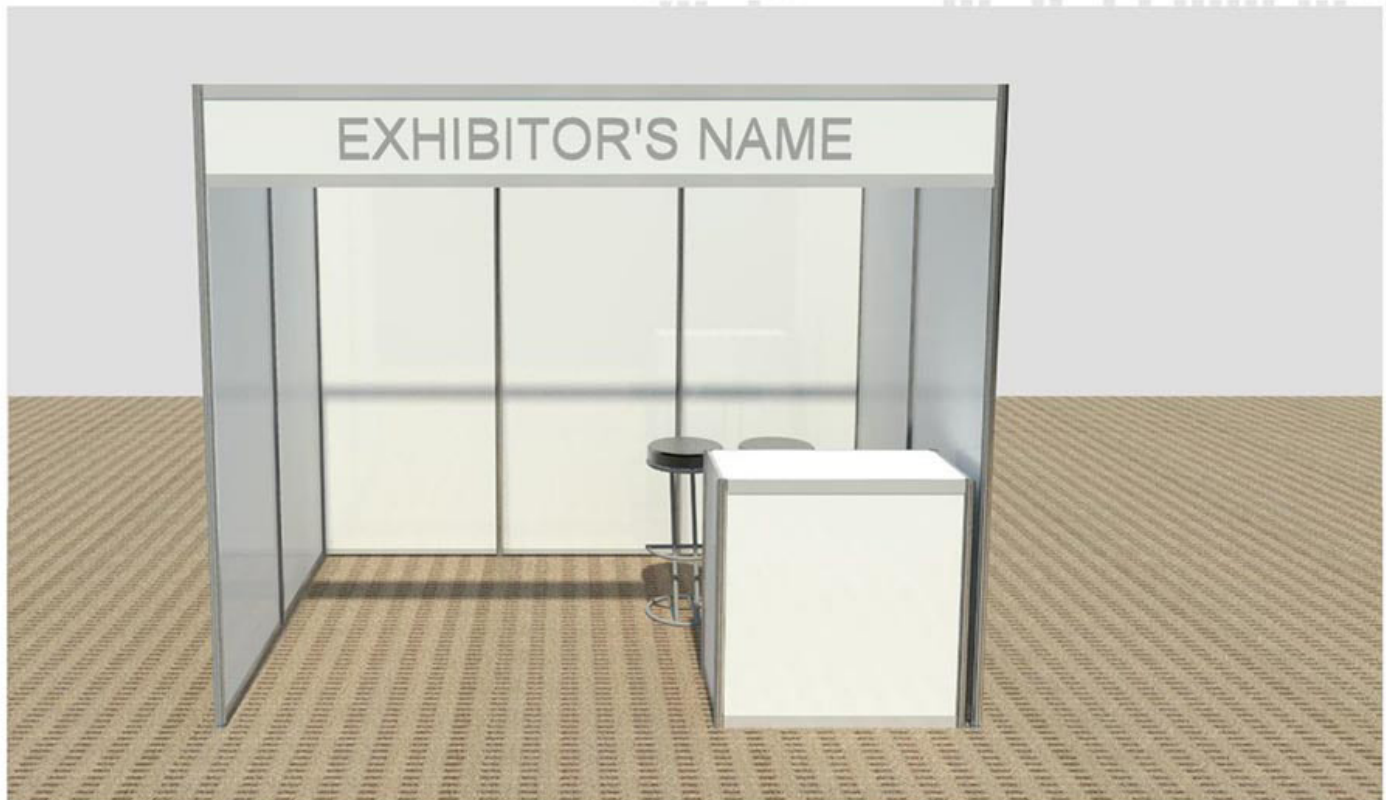
STANDARD BOOTH 3X2 - With counter and two stools